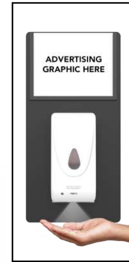
^ Wall Mounted w/ graphic