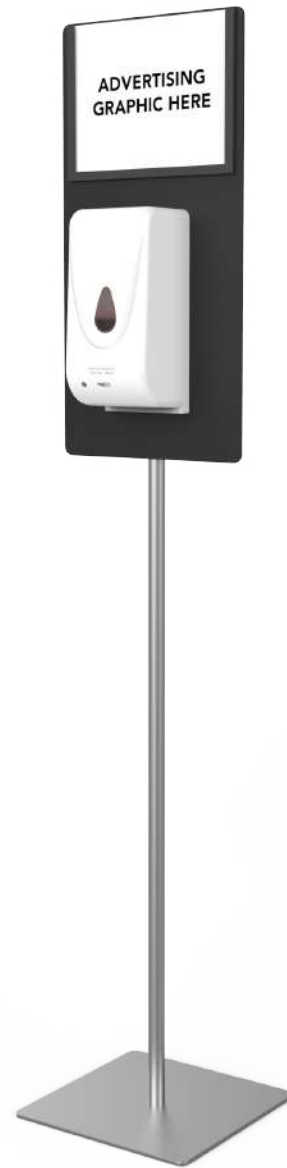
^ Floorstanding w/ graphic

Contact your Spectas Account Executive for details