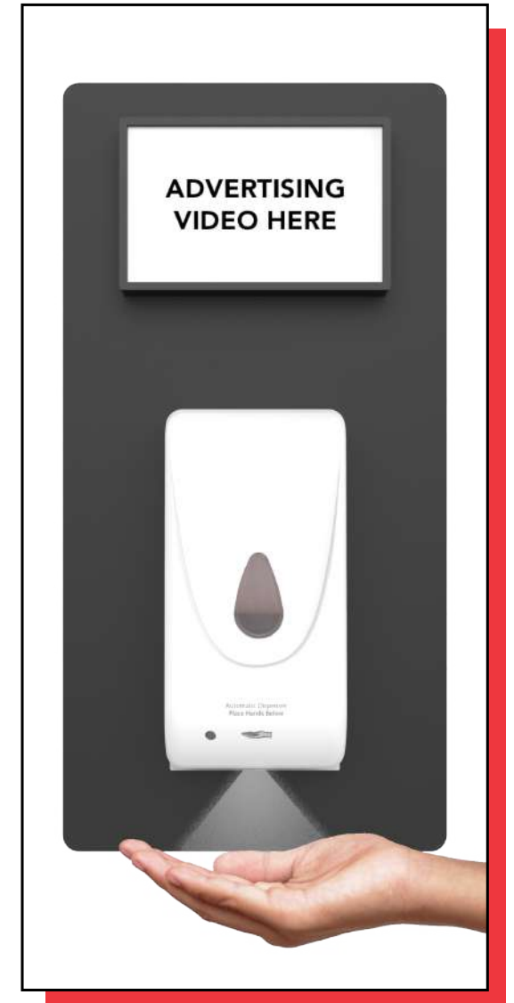
^ Wall Mounted w/ 10" media