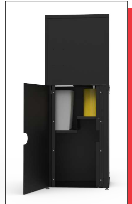
^ Rear Access Panel showing trash can and cart wipe carton